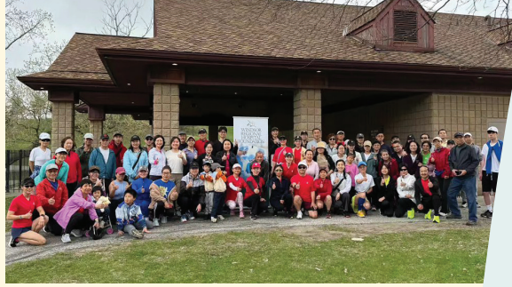
Community members at the ECCCA's Run/Walk-a-thon fundraiser

The Chinese community of Windsor and Essex has committed to a landmark $500,000 pledge to Windsor Regional Hospital Foundation for the new hospital.