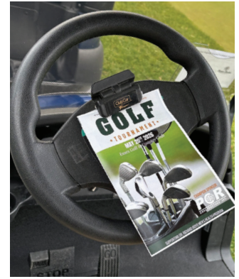
Champion Sponsor - PCR Constructors Ltd. Foursome

demonstrated that community healthcare is a collective priority."