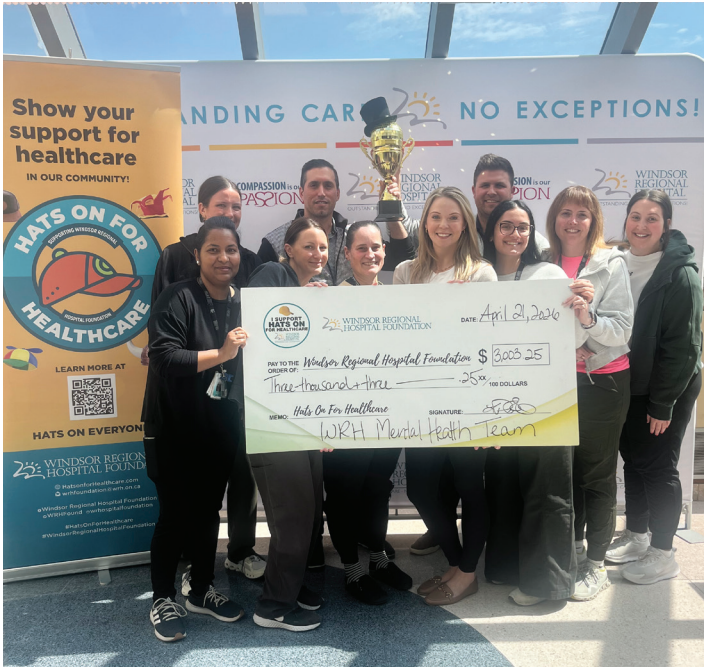
Top Windsor Regional Hospital Staff Team – Mental Health Team

The 2026 Hats On for Healthcare campaign made history by smashing its $100,000 goal! Supported by title sponsor Greg Monforton and Partners, this 17th annual event raised its highest total ever. This achievement pushes the campaign's lifetime impact past $800,000 for Windsor Regional Hospital Foundation.