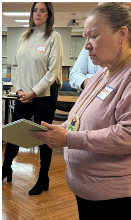
Participants had an opportunity to get a taste of a variety of materials used in floors, ceilings and walls and learn about pros and cons of each.

variety of samples, while encouraging participants to share their own experiences with different materials used at the two current WRH campuses. She warned the group that no material is perfect and encouraged members to consider a variety of factors before making final decisions.