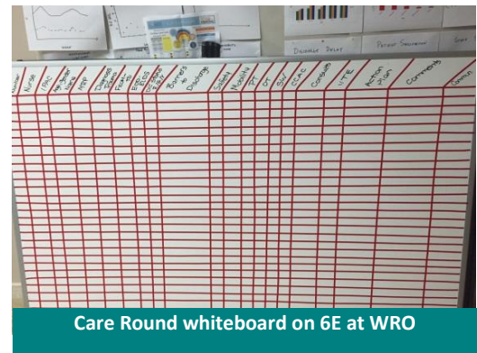
Care Round whiteboard on 6E at WRO