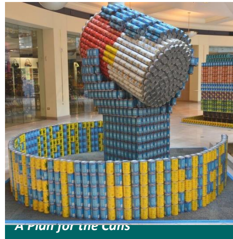
A Plan for the Cans

Over the next few weeks, there will be containers in the SOP offices at both sites to drop off your donated cans. Each week, the two teams will set a goal for that week and if the target number of cans is reached, something will happen to a member of the SOP team. Come to the huddles this Friday to catch a sneak peak of what this fun for a cause is all about!