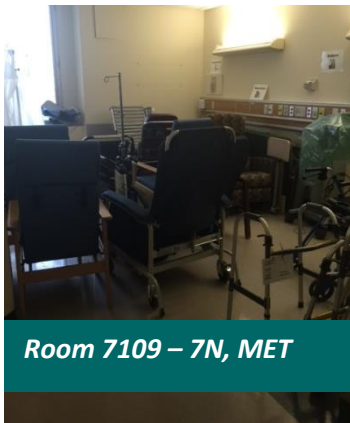
Room 7109 – 7N, MET

The Standardized Unit project team will be working with 7N & 8N at the Metropolitan campus to complete a 5S on the units. 5S is a workplace organization methodology that involves arranging spaces for an efficient, effective and safe work environment. The team will be focusing on storage areas, hallways and the communications desks. Work will commence on Monday November 23 rd and wrap up Tuesday Nov. 24/15.