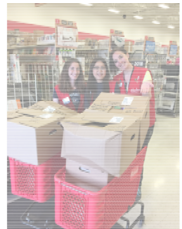
Photo right: Michael's Arts and Crafts staff rolling out the books for Paediatric Services.

Thanks to Michael's Arts & Crafts Windsor outlet, approximately 1000 books were donated to Paediatric Child Life Services. The books are used as Treasure Box items, rewarding young patients for bravery during treatments and clinic visits.