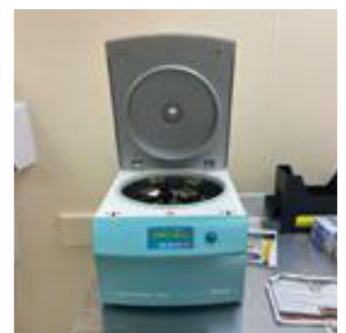
Centrifuge for the Renal Program

ArcelorMittal Windsor, a long-time supporter of the Windsor Regional Hospital Foundation, donated $10,000 to help purchase a Centrifuge for the Renal Program through its Charitable Donation Campaign. Employees made donations that were topped up to $10,000 by the company. This Centrifuge improves safe and timely blood sampling for patients undergoing hemodialysis to ensure proper treatment.