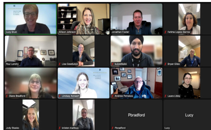
Members of the Emergency Department User Group were happy to discuss the future of Emergency Care during their first Functional Program Planning meeting

The goal is to have the functional program, the block schematic drawings and early cost estimates ready to submit to the Ministry of Health by next spring.